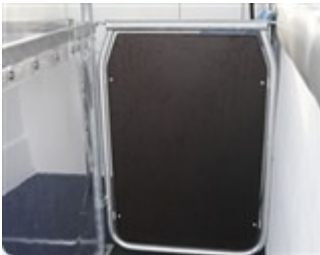
Front/foal partition prevents the foal/the horse from passing under the front bar.