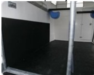
Rubber kick sheet protects the trailer against horse's hooves.