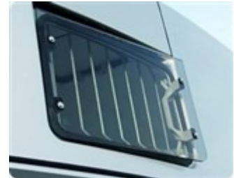
Side windows with 5 way opening