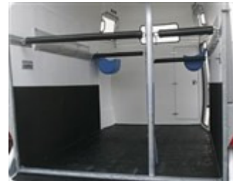
1/3-2/3 rear bar for displaced partitioning wall