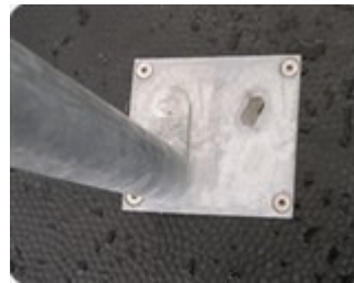
Double bottom fitting