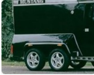
Alu-Sportrim gives an extra dimension