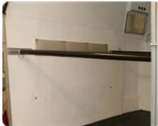
Throughgoing bar for driving without separation wall or with the separation wall moved aside