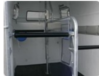
Double bar system offers the possibility of adjusting the height of the bars