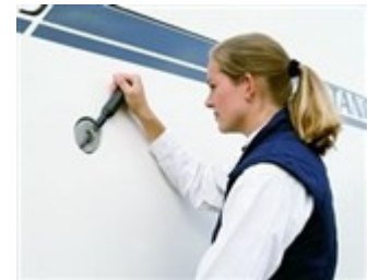
Exterior release for the safety bar

Mustang horse trailers can be delivered with a total weight of 2000 kg or 2400 kg as required.