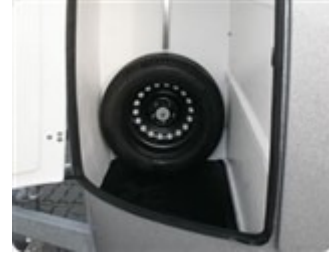
Spare wheel. Fittings for storage in saddle locker