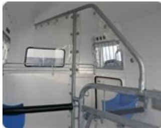
Transparent or black head/stallion partition separates the horses completely