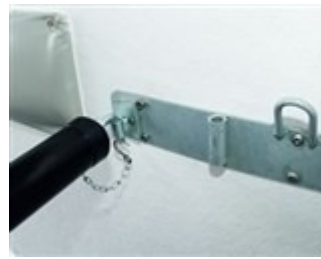
Practical space to feed horses