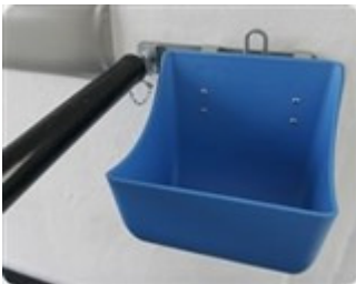
Side padding and feeding trough