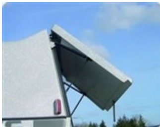
Rear door : three different positions

Mustang horse trailers comply with EU road vehicle legislation.