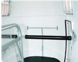
Extra space in front of the horses